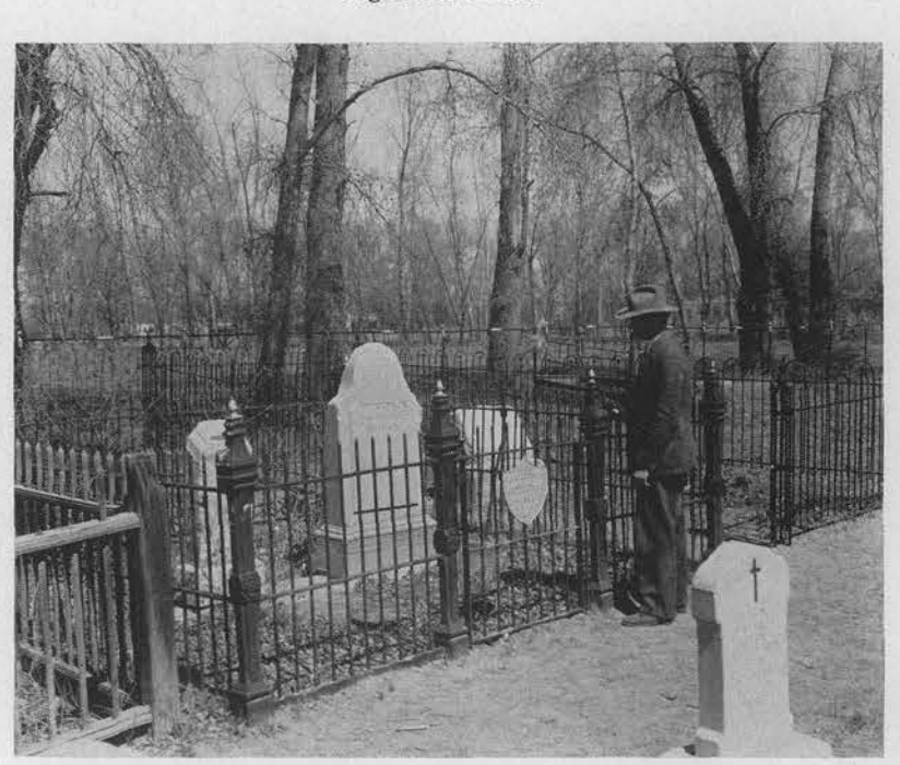
FRONTIER SCOUT Kit Carson lies buried in the little cemetery at Don Fernando de Taos, not far from the wild mountain places he called home.